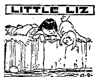
If you could live your life over again you would probably start sooner to make the same mistakes.

By United Press International NUMADA, Japan, Dec. 9.—Two Education Hall by 1500 angry par-