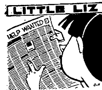
What a swell feeling it would

They were arrested on complaint between. of Lower Valley housewives, who said the swindlers were trying to