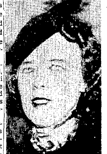
Martha Dodd Stern

Chairman Walter, Pennsylvania Democrat, of the House Committee on Un-American Activities said Morros has named Marsha Dodd Stern as a Soviet spy's counter-spy activities to the Soviets. Mrs. Stern is the William E. Dodd, who was ambassador to Nazi Germany from 1933 to 1938. She and her husband recently vanished from Mexico City and belief has been expressed both are now behind the Iron Curtain. Walter said testimony by Morros "clearly established Marsha Dodd . . . and her husband, Alfred Stern, as part of the Soviet apparatus." Stern is a wealthy investment broker.