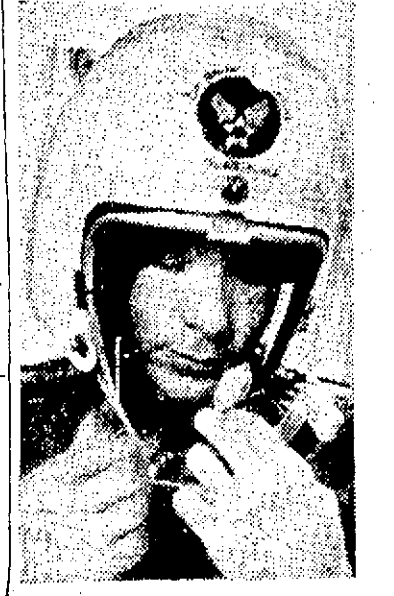
Maj. David G. Simons

By United Press BRainerd, Minn., Aug. 19.—An Air Force doctor has soared 21 miles into the sky to set a new manned balloon altitude record. The large but frail balloon reached an altitude of more than 110,000 feet at 10:30 a. m. two hours after take-off. It exceeded the old record of 96,000 feet. The balloon rose nearly vertically from its take-off site in an