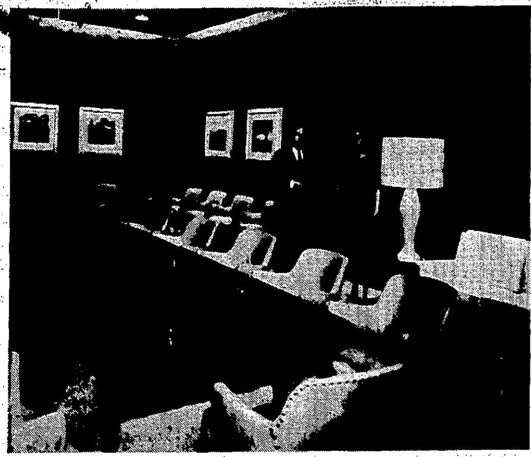
CONFERENCE ROOM—Glimpse of remodeled conference room at State National Bank.