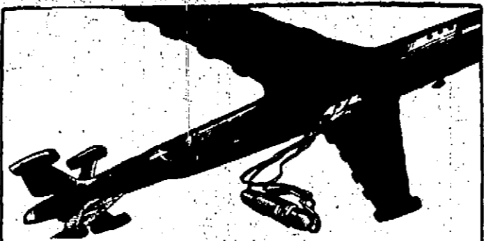
As his sub stroked back toward Melbourne, Commander Towers told scientist John Osborne that the Egyptian planes that bombed Washington and London during World War III bore Russian markings and the retaliatory bombing of Russia was, therefore, a tragic mistake.