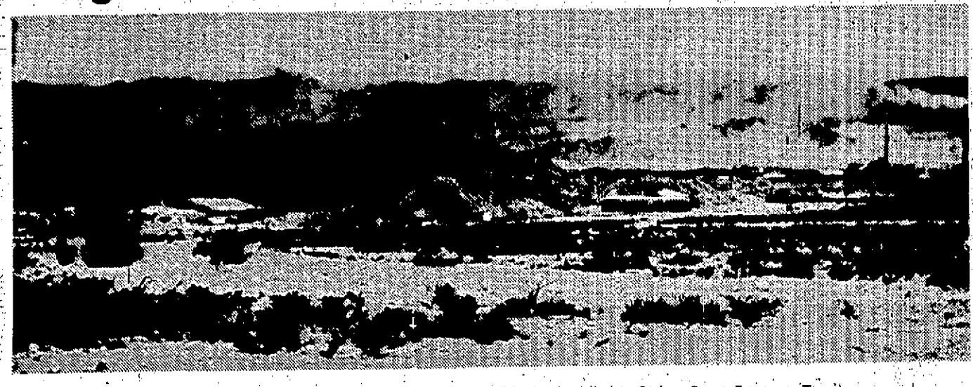
OVER CITY—Sweeping view of mountains and valleys is offered home builders in Ridge Crest Estates. Two homes under construction are visible in center.