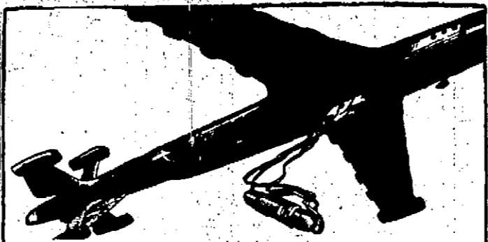
As his sub stroked back toward Melbourne, Commander Towers told scientist John Osborne that the Egyptian planes that bombed Washington and London during World War III bore Russian markings and the retaliatory bombing of Russia was, therefore, a tragic mistake.