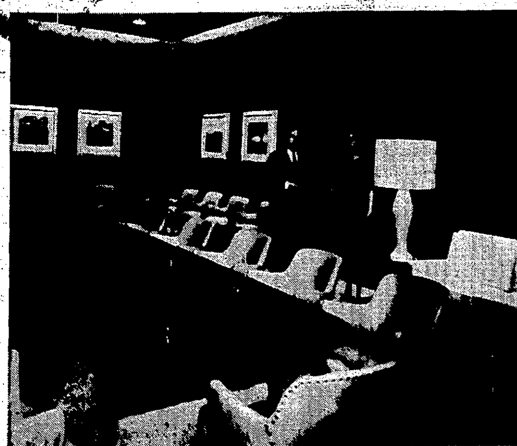
CONFERENCE ROOM—Glimpse of remodeled conference room at State National Bank.