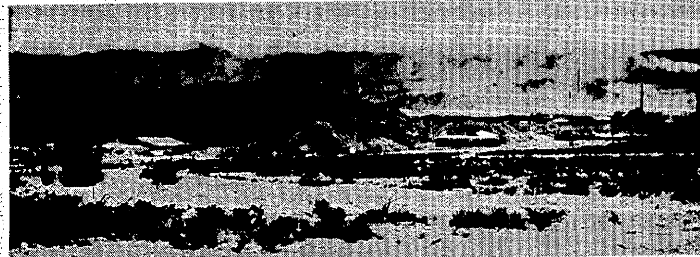
OVER CITY—Sweeping view of mountains and valleys is offered home builders in Ridge Crest Estates. Two homes under construction are visible in center.