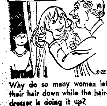
Why do so many women let their hair down while the hairdresser is doing it up?