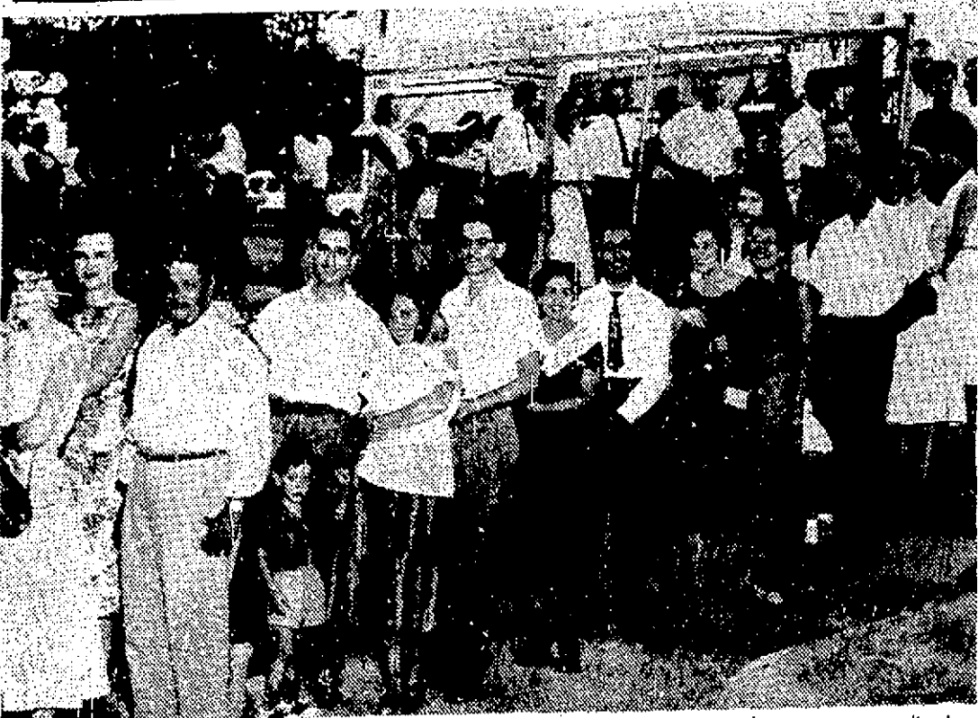
AWAIT SHOTS—Long lines form in front of Lamar School as citizens await Salk polio inoculations.